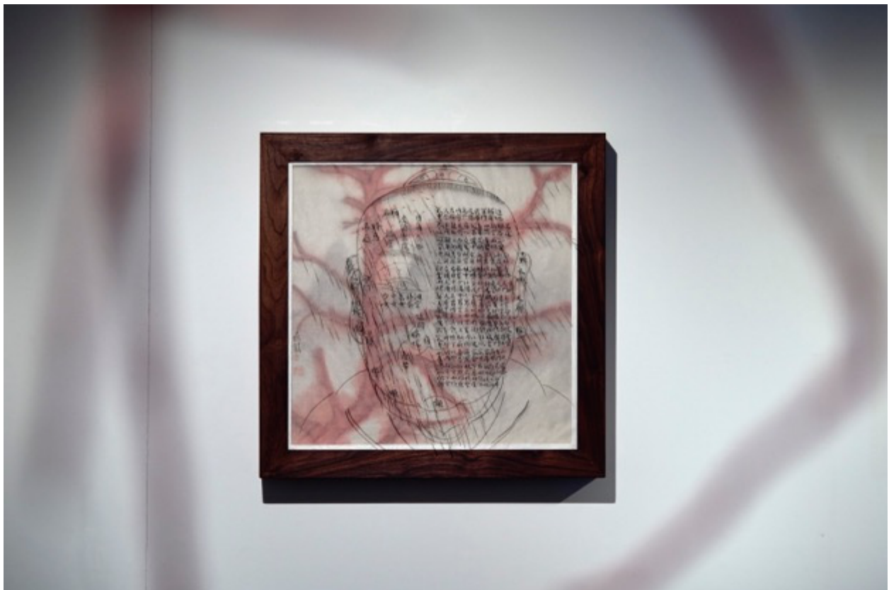
Secret Path 4 , Ink on silk and paper, 50 x 50 x 8 cm, 2018

As the world emerges from a devastating pandemic, the artist's sensitive unveiling of the nexus of human frailty and contemporary life has never been more relevant. Her practice has long dealt with issues of wellness, and the collision of philosophical ideals with mental and physical vulnerability. Previous exhibitions such as Essence at the Hong Kong Museum of Medical Sciences in 2016, and A Quest for Healing at the Surgeons' Hall Museums in Edinburgh in 2018 explored individual physical fragility, whilst 2019's prophetic Seclusion exhibition at Ora-Ora in Hong Kong developed the theme to explore isolation and alienation.