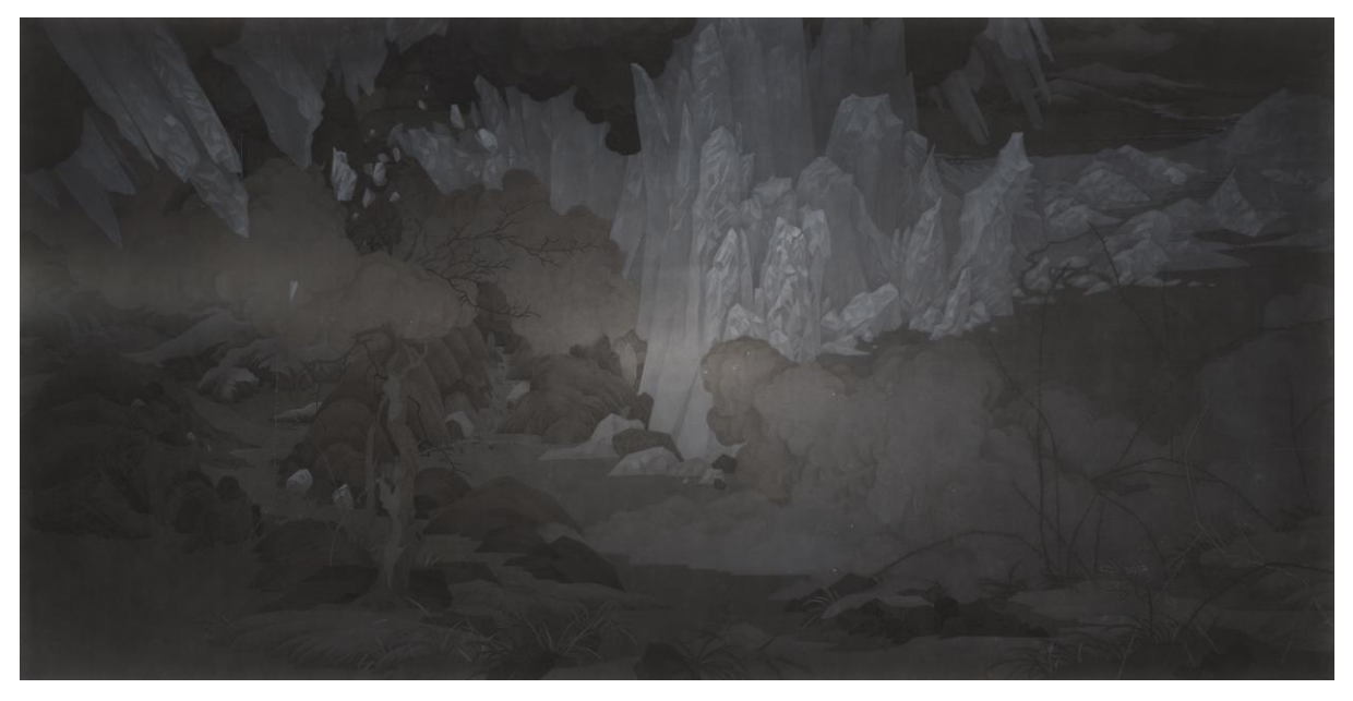
Pure Mountain Stream, Ink on Paper, 123 x 243cm, 2017