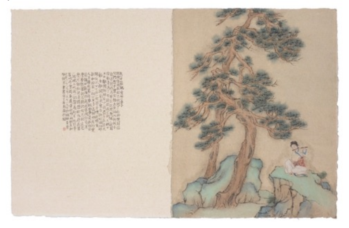
Migrations of Memory No.3, 2017, Rice paper, plain painting, 60 x 38 cm

Her works have been collected by the National Art Museum of China, the Hong Kong Museum of Art, the Asian Art Museum of San Francisco, the Guangdong Art Museum, the He Xiangning Art Museum, the M+ Museum, the Uli Sigg Collection, the DSL Collection and many more.