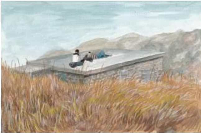
(左) He photos the Sky (Hut 16) 塑膠彩畫布 17.6 x 26.5 cm 2013

山取景寫生，以最原始的肉眼去觀察、最純粹的方式去繪畫自然風景。他的寫生之旅不單是記錄下旅程的種種，還建立了他細味自然之美的一套方式，靜觀微風緩緩牽動草木，成了藝術家一個自我治療的過程。黃進曦帶他的思緒離開城市繁囂而進入自然之中，在原野間得著釋放、平靜和安穩。