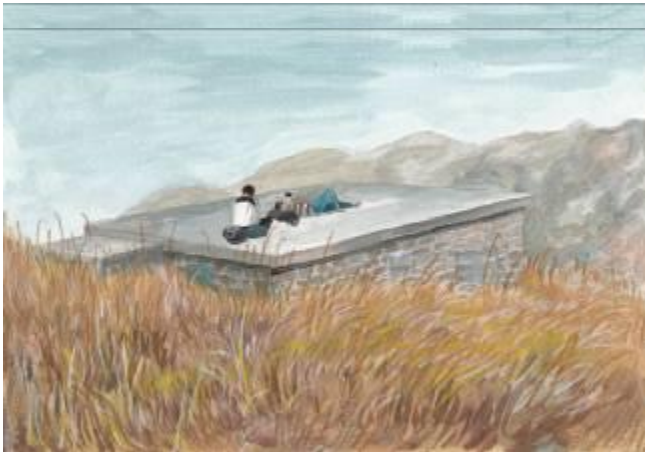
(Left) He photos the Sky (Hut 16) Acrylic on canvas 17.6 x 26.5 cm 2013

between himself and the landscapes he paints, he let himself be completely surrounded by nature. Since 2013, he began a weekly ritual of hiking with his painting tools and spending the day sketching on site. Observing nature most primitively through his bare eyes, he depicts the natural landscape by the purest approach. More than just a log of his journey, this routine led him to develop his approach to appreciating nature, where a gentle breeze among trees and bushes can be seen as a sign of tranquility, acting as a process of self-healing. Being able to focus his thoughts and emotions away from the noise in the city, the wilderness brings a sense of alleviation, serenity and calmness to his mind, allowing him to escape from the urban realities.