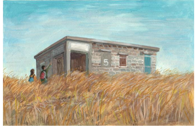
(右) There are Some Words on the Hut (Hut 05) 塑膠彩畫布 17.6 x 26.5 cm 2013

黃進曦是次的作品多取景自香港的自然山嶺，是他作為土生土長香港人的一個情意結。儘管一般人對香港的印象都不外乎海港和摩天大廈，他卻選取截然不同的角度去讓觀者重新體會這個地方，他的風景作品不只描繪了香港獨有的山林佈局，更常於畫面穿插許多與自然共存的人為事物，訴說著關於城市和自然的故事。是次展覽其中一系列廿一幅的作品繪畫了大東山上散落的石屋，以及該處所聚集各種來自城市的人：他們來去匆匆，慣常地投入於自己的電子器材，或隔著鏡頭去觀望，云云之中似乎沒有多少人願意為風景停留，因為他們即使身處郊野仍無法撇下都市習性。此系列的作品表現了人與自然之間的對照及張力，也正表達了同樣是城市人的藝術家自己的內心掙扎和疑問。