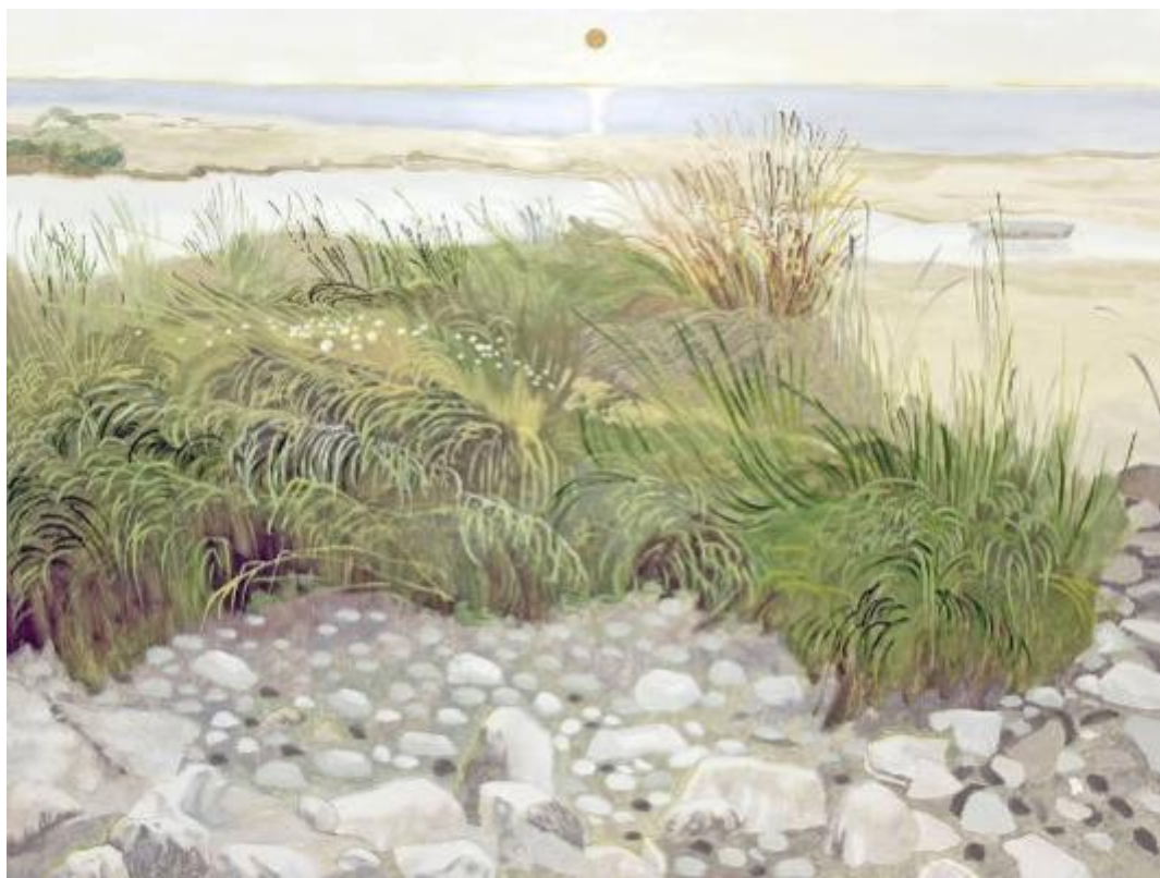
The Mudflat for Sunset 油畫畫布 90 x 120 cm 2013

(香港- 2014年3月3日) 城市也許標誌著一種進步，卻同時帶來庸碌的生活。我們這群城市人整日活在資訊氾濫的社會當中，若有一天選擇退步大自然，可會發掘到另一種的視野？經過一年多的緊密籌備，Galerie Ora-Ora 是次的展覽「退步自然」展出了藝術家黃進曦於過去一年持續不斷的戶外寫生繪畫創作，回歸對自然風景最原始的觀察和最純粹的感受，藝術家以「退步自然」作為一種生活哲學，一方面鼓勵城市人放慢節奏去享受大自然的旅程，另一方面表達他作為城市人遊歷原野時所衍生的想像和思考。