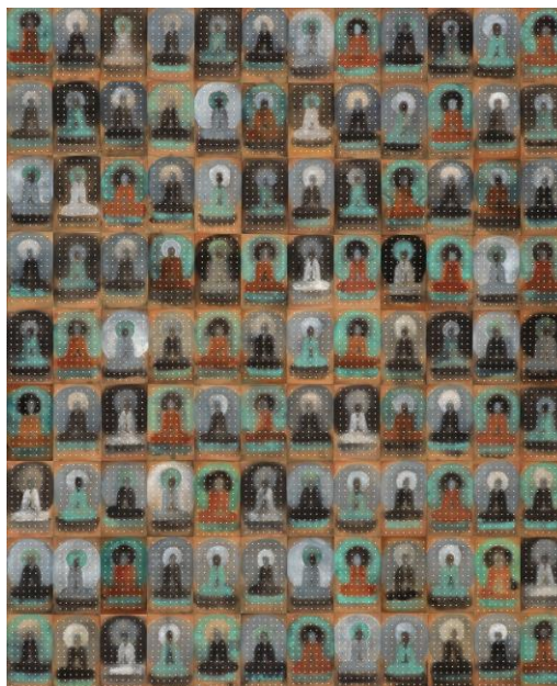
止痛帖, 180 x 108 cm, 布面水墨, 2012-2013