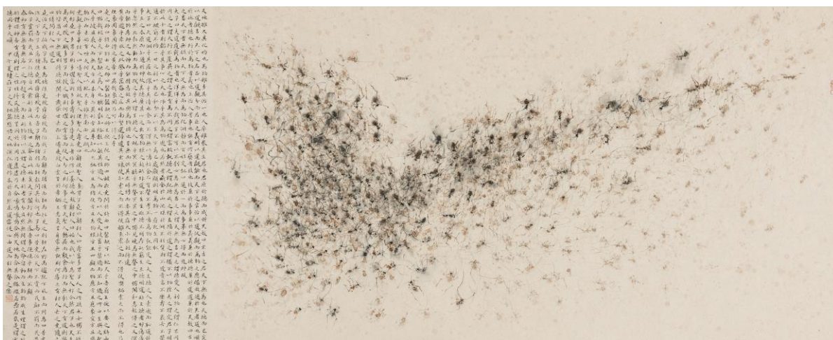
The Falling Star in July, 248 x 97 cm, ink on paper, 2014