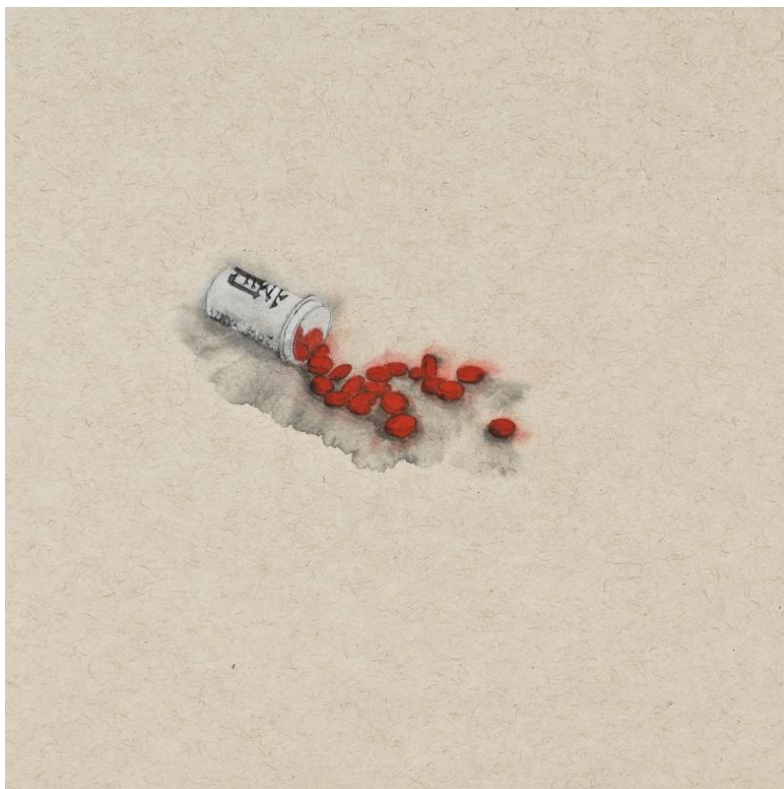
Registration (146), 40 x 40 cm, ink on jute paper, 2014

'Aches, physical or psychological, from the moment we were born, they will accompany us to our death.' – Zhang Yanzi