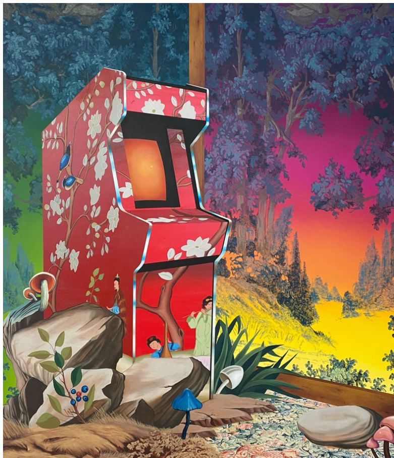
斯蒂芬·索普，《A Mythical Intersection Between Two Worlds》，2023 布面油畫，152 x 132 cm

斯蒂芬·索普是美國薩凡納藝術與設計學院的繪畫教授，在 2022 年創作了《Enter the Forest and Lose Your Mind and Find your Soul》及《The Depths of the Forest is Where Silent Minds and Deep Souls Can Be Found》兩幅作品。在民間傳說和索普的作品當中，森林都具非常重要的象徵意義，代表大家尋找真我的宏大旅程。死亡與重生週而復始，在這過程中，森林鼓勵大家挑戰自我，測試自身極限。森林同時也是一股未知的黑暗，究竟要否探索這片森林，我們往往猶豫不決。索普的作品可見色彩區分鮮明：地上的奢華手織工藝品以精緻的細節繪出，活靈活現，盡顯畫家風範；牆壁由厚重的顏料覆蓋，以豐富的層次、陰影與刻度作點綴。索普亦把隱喻帶入畫中的角落和街機，表達縈繞不去的心理創傷和掙扎，引起深深的共鳴。Ora-Ora 這次參展的焦點之一，就是展出索普的新作《A Mythical Intersection Between Two Worlds》（2023）——他的街機畫作一直大受歡迎，這部新作品就是其中之一。