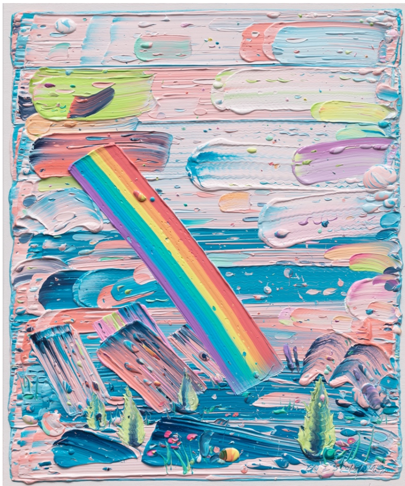
異李貞恩，《There, rainbow in the sunset_202345》，2023