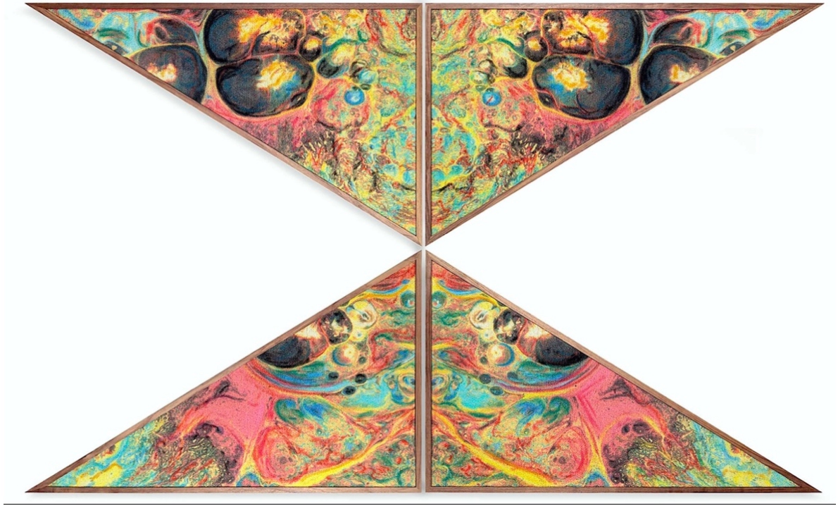
唐子良, 《Ex Materia (Transfiguration) / Part IV》, 2023 水彩、油和蠟膏、UV 油墨、羊毛, 145 x 118.5 x 4.5 cm (四聯)

唐子良則帶來四幅新作，同屬廣獲好評的《Ex Materia》系列，分別為《Ex Materia (Chrysalis)》Parts II, III, VI 以及《Ex Materia (Transfiguration)》Part IV（全部於 2023 年創作），作品皆採用油墨及羊毛創作。系列分支之一的《Ex Materia (Chrysalis)》以蟲蛹象徵邁向重生的旅程，呈現出蘊含美學、和諧、平衡與對稱概念的視覺時序。唐氏從蝴蝶和蛾子翅膀上的亮眼配色獲得靈感，這些鮮豔色彩及紋樣對於昆蟲來說是重要的視覺訊號，而他想要對此致敬，所以選用鱗翅目圖案進行創作。而整個《Ex Materia》系列皆受到瑞士心理學家赫曼·羅夏克（Hermann Rorschach）啟發，沁透出心理層面的各種可能。每幅作品都是一個組件，提供無數的組合與排列去懸掛作品。因此，每次懸掛構圖的變動都能讓觀眾沉浸在全新且無限的視覺印象和詮釋之中。唐氏在巴塞爾藝術展香港展會 2023 首次隨 Ora-Ora 參展，同期在畫廊舉辦個展，並大獲成功。韓國國際藝術博覽會是唐氏繼這兩個展覽之後首次赴外地參展。