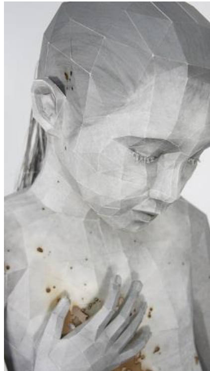
許曉楓，儀式，130 x 30 x 30 cm，紙本，2012

在澳門當代藝術的發展歷程中，由於地域制約和市場局限，對於藝術脈絡的梳理與完善藝術生態的建立尚待完成。因此在這種「進行時」的時態之中，藉由多區域間發達的藝術產業環境，推動澳門當代藝術，拓展其國際影響力，無疑是極具意義的。方由美術希望通過今次展覽的舉辦，借力香港成熟的藝術市場與完善的藝術產業，繼續拓展澳門當代藝術的國際能見度。作為亞洲藝術中心之一，世界級收藏家、專業人士、藝術愛好者匯聚於此，本地及國際藝壇的高度關注勢必將助力澳門藝術的展示。