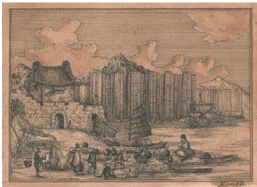
霍凱盛，樂園 15 • 20，14.5 x 23 cm，針筆畫，2015

在澳門當代藝術的發展歷程中，由於地域制約和市場局限，對於藝術脈絡的梳理與完善藝術生態的建立尚待完成。因此在這種「進行時」的時態之中，藉由多區域間發達的藝術產業環境，推動澳門當代藝術，拓展其國際影響力，無疑是極具意義的。方由美術希望通過今次展覽的舉辦，借力香港成熟的藝術市場與完善的藝術產業，繼續拓展澳門當代藝術的國際能見度。作為亞洲藝術中心之一，世界級收藏家、專業人士、藝術愛好者匯聚於此，本地及國際藝壇的高度關注勢必將助力澳門藝術的展示。