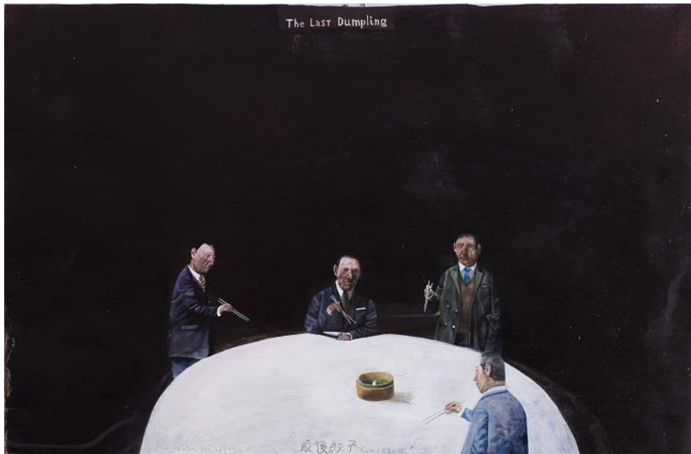
君士坦丁，最後餃子，28 x 36 cm，木板油畫，2015

由方由美術與澳門視覺藝術產業協會聯合主辦，澳門特別行政區政府文化局贊助的《微元素——澳門當代藝術進行時系列展，香港站》將於十一月二十六日正式開幕。是次展覽，將展出君士坦丁、霍凱盛、許曉楓、黎小傑、吳少英、百強及戴永寧共七位澳門藝術家的精彩作品，旨在為他們提供一個更廣闊的展示平台，重點推介澳門當代藝術創作，從而展現出澳門藝術的獨有活力與其多姿多彩的一面。