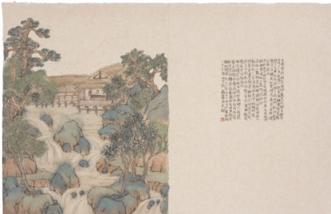
Migrations of Memory No. 9, 2017, Rice paper, plain painting, 60 x 38 cm

Galerie Ora-Ora will be at Booth C10 at Volta13, Markthalle, Basel, Switzerland from June 12 to June 17, 2017. For questions for the artist, please contact the gallery.