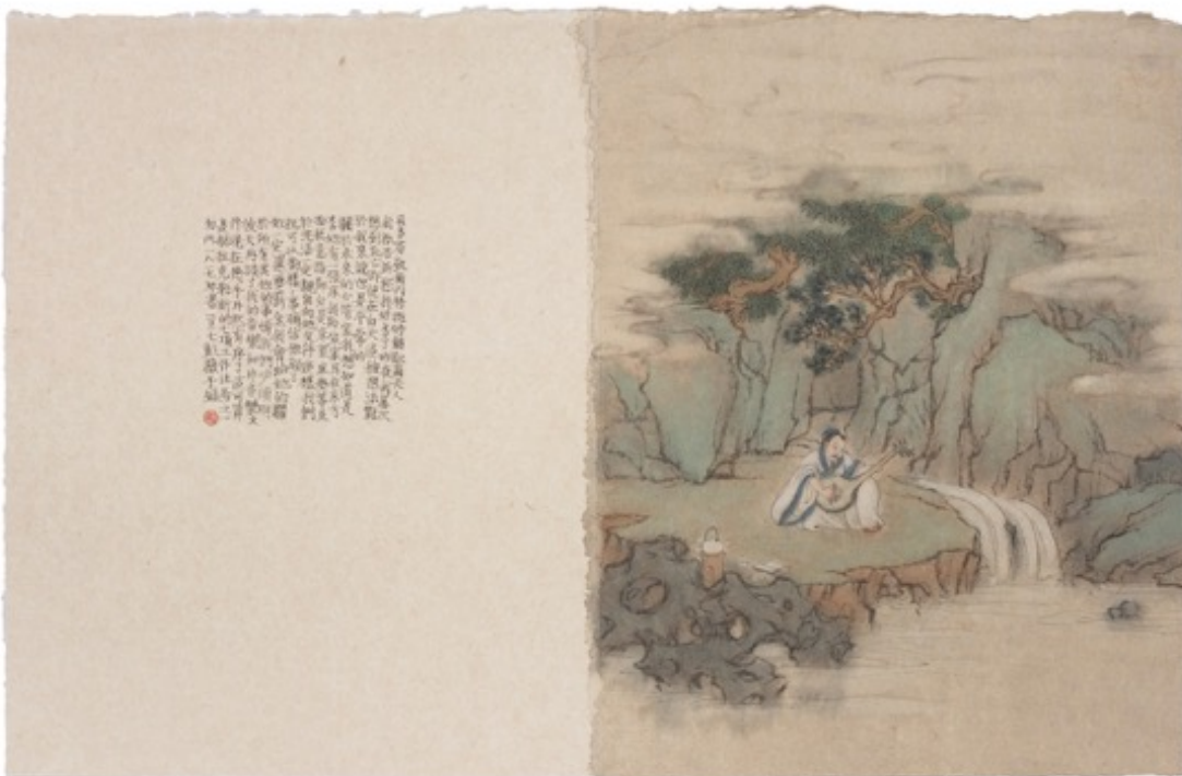
Migrations of Memory No. 2 , 2017, Rice paper, plain painting, 60 x 38 cm