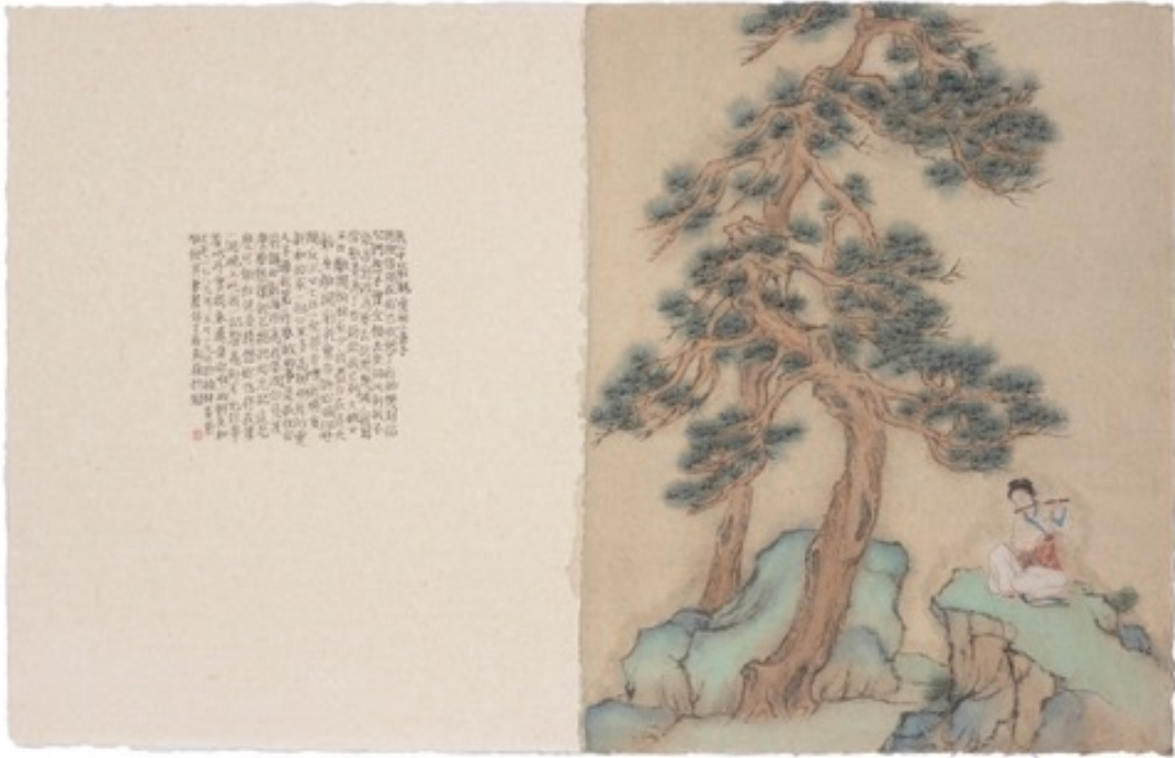
Migrations of Memory No.3 , 2017, Rice paper, plain painting, 60 x 38 cm

Her works have been collected by the National Art Museum of China, the Hong Kong Museum of Art, the Asian Art Museum of San Francisco, the Guangdong Art Museum, the He Xiangning Art Museum, the M+ Museum, the Uli Sigg Collection, the DSL Collection and many more.